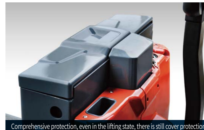
Comprehensive protection, even in the lifting state, there is still cover protection