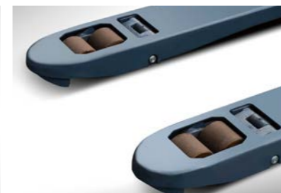
Standard two-wheel mechanism