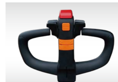
Integrated handle design