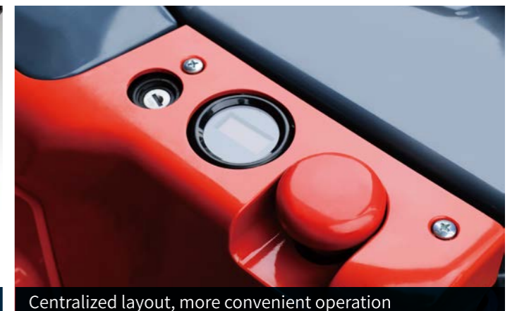
Centralized layout, more convenient operation